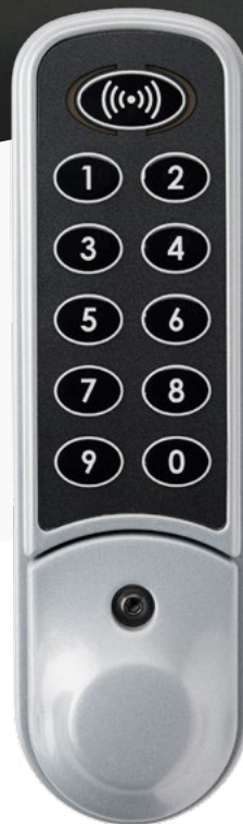
Product ID: 3964

Available in wet area version, public, private and RAS remote allocation modes, typical applications for the lock include commercial and office environments, lockers and enclosures.