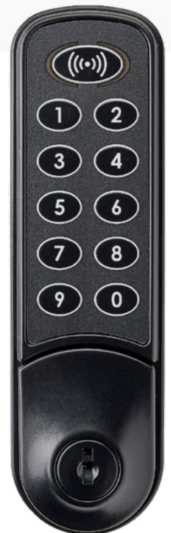
Product ID: 3963