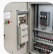
Telecom boxes and technical panels

This latchlock ensures padlock-level protection with flexible key access.