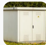
Utility cabinets and enclosures