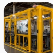
Industrial access doors with padlock security