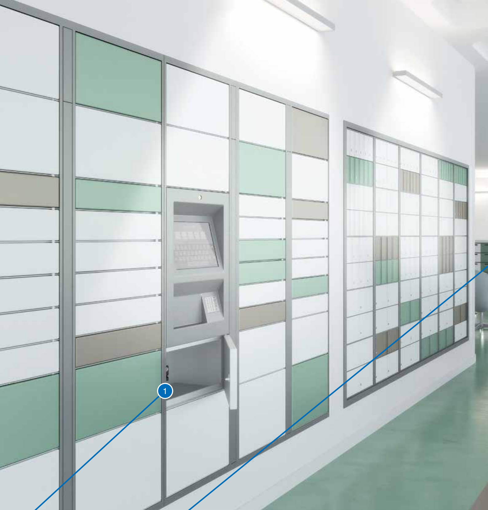
1. Electronic Latchlock